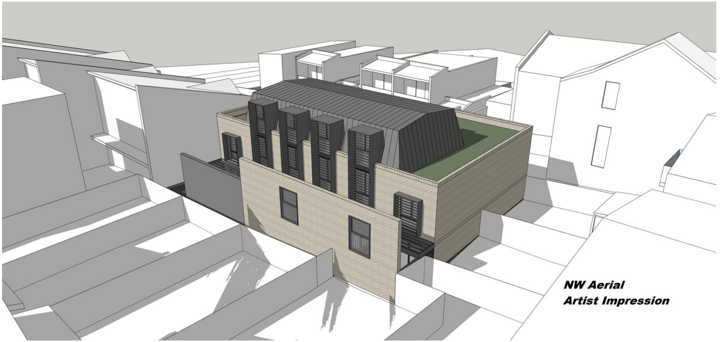
NW Aerial Artist Impression